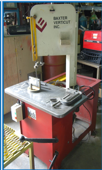
BAXTER VERTICUT 115B BANDSAW