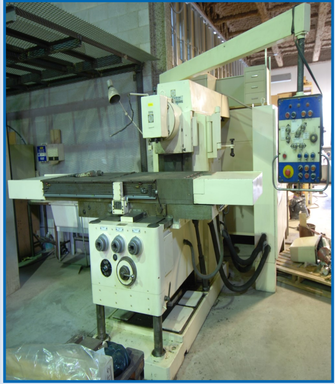
TOS KURIM FD 40H-PPF UNIVERSAL MILLING MACHINE