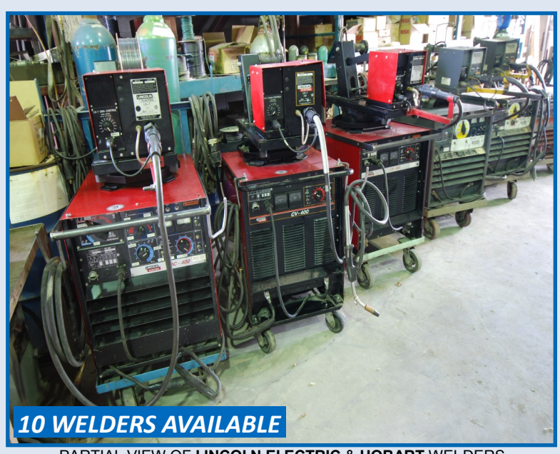
PARTIAL VIEW OF LINCOLN ELECTRIC & HOBART WELDERS