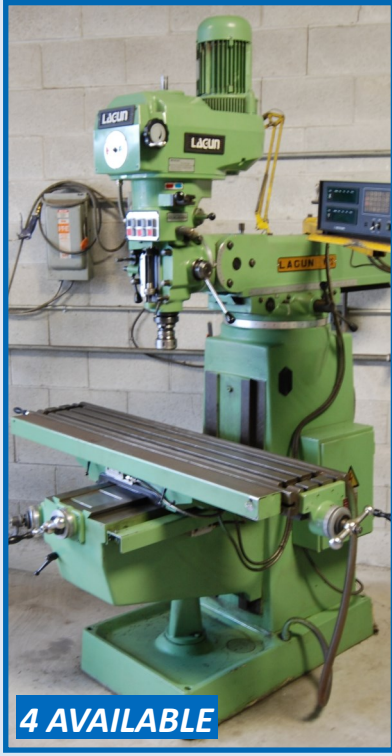
LAGUN FTV-2S VERTICAL MILL