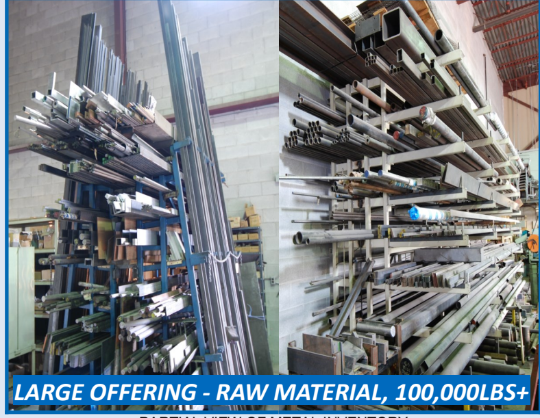
PARTIAL VIEW OF METAL INVENTORY