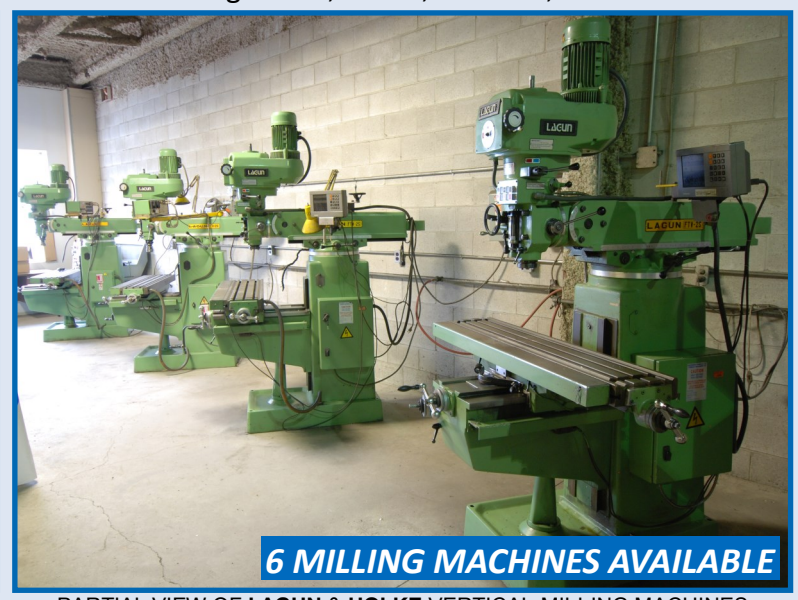
PARTIAL VIEW OF LAGUN & HOLKE VERTICAL MILLING MACHINES