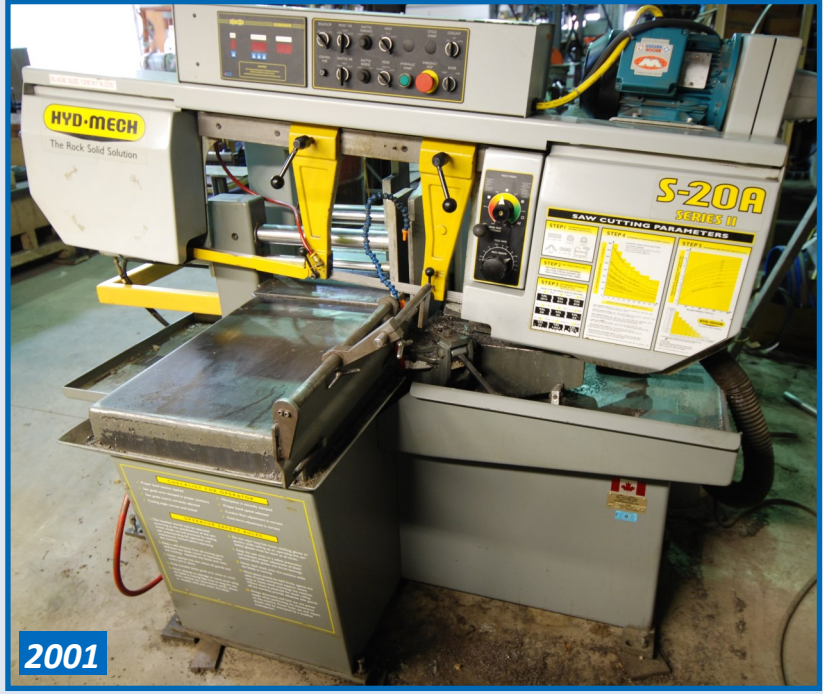
HYD-MECH S-20A SERIES II AUTOMATIC HORIZONTAL BANDSAW