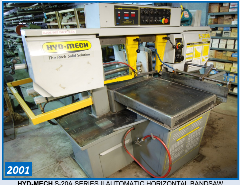
HYD-MECH S-20A SERIES II AUTOMATIC HORIZONTAL BANDSAW

111 Tigi Court, Unit 3, Concord, Ontario